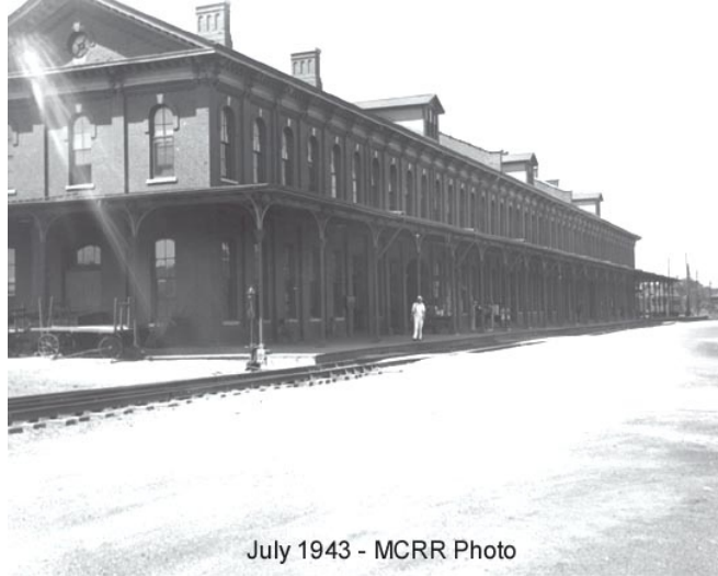
July 1943

The arrival of the Canada Southern Railway to St.Thomas in 1871 was one of the most historically significant events for the city. An architectural gem, this building was designed in the Italianate Style and opened in 1873. Currently owned by the On Track Group, with plans to restore the Station to its original historic charm.